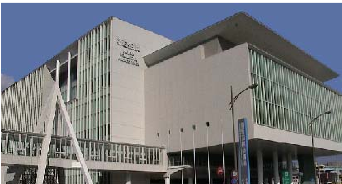
Fukuoka International Congress Center

URL: http://www.marinemesse.or.jp/english/kaigi/index.html